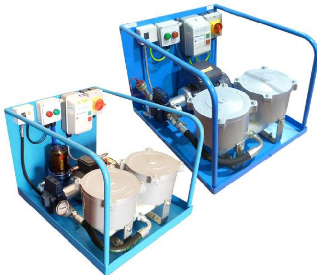
Selection of FA-ST MS2 Standard Filtration Systems