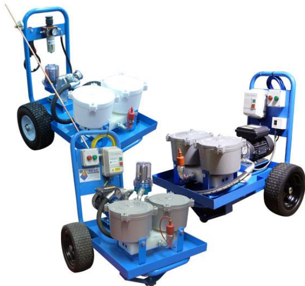
Selection of FA-ST MS2 All Terrain Filtration Systems