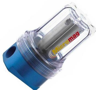
MM5 MagneticPre Filter

The innovative design of the MicroMag Magnetic Filter Systems offers users the ability to remove large amounts of ferrous debris from cooling & fuel systems, oil reservoirs, or any fluids that magnetic particles can build. By using magnetic filtration harmful ferrous particles even down to a sub-micron in size can quickly be extracted from fluids. This extensive filtration can prevent abrasive wear occurring to components, remove particulates that can allow bugs & bacteria to develop, in turn leading to a fluid's life being greatly increased.