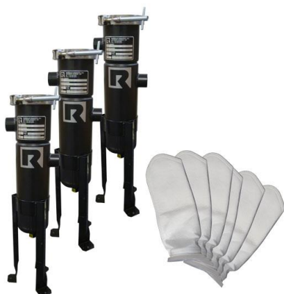
FA-ST Bag Filter Housing & Replacement Bag Filters

The FA-ST 12-inch Carbon Steel Bag Filter Housing is the ideal accessory to the FA-ST filtration systems, to remove additional contamination from extremely dirty oil, diesel, and coolants.