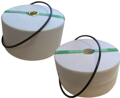
FA-ST 1888SH & 2088CPS High Viscosity Oil Filter Elements

The high viscosity oil filter cartridges are especially designed to filter oils of a higher-grade viscosity between 320 – 1000 cSt. The design of these cartridges will allow the higher-grade oils to be pushed through the filter media without creating a build-up of back pressure tripping out the filtration system. They can provide filtration on lower grade oils and diesel however the standard oil & diesel filters are far more cost effective. The high viscosity oil filters come in 2 special designs: