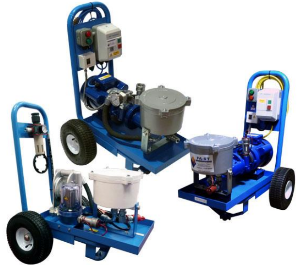
Selection of FA-ST MS1 All Terrain Filtration Systems