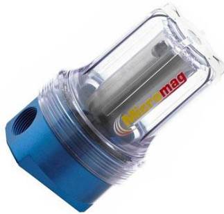
MM5 MagneticPre Filter

The innovative design of the MicroMag Magnetic Filter Systems offers users the ability to remove large amounts of ferrous debris from cooling & fuel systems, oil reservoirs, or any fluids that magnetic particles can build. By using magnetic filtration harmful ferrous particles even down to a sub-micron in size can quickly be extracted from fluids. This extensive filtration can prevent abrasive wear occurring to components, remove particulates that can allow bugs & bacteria to develop, in turn leading to a fluid's life being greatly increased.