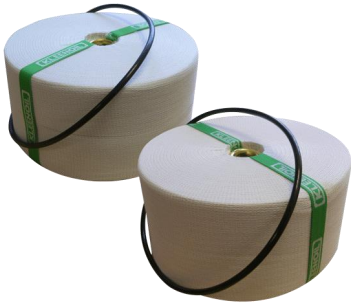
FA-ST 2088PP & 2088PP6 Coolant & Glycol Filter Elements

The FA-ST coolant & glycol filter cartridges are ideal for removing particulate contamination from water-based fluids. These cartridges are especially designed to let water pass through the filter while entrapping particles making them ideal for coolants and glycols. These filters can be used with most filtration systems and only require the unit to be flushed of any oil or diesel for the units to be able to provide filtration on water-based fluids. Used for tanks up to 300 gallons/ 1360 litres.